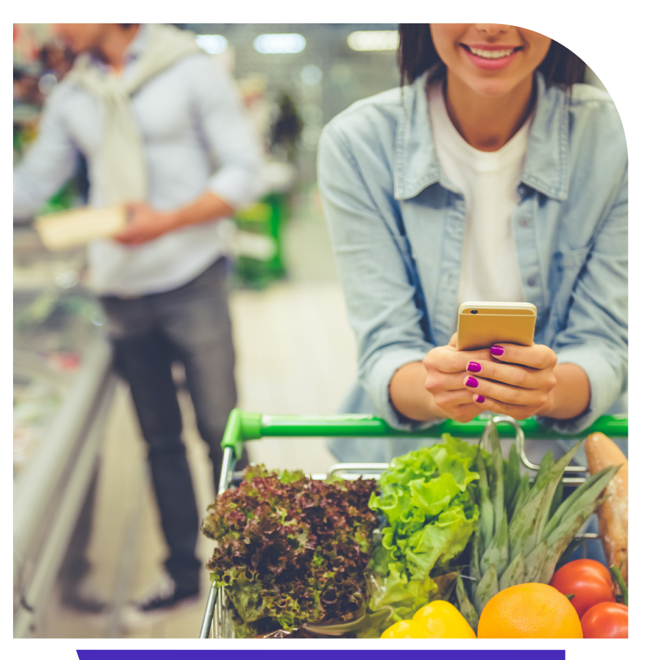
Apply Today at Democracyfcu.org