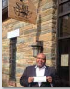
Democracy FCU's DC Branch collected monetary donations for So Others Might Eat (SOME), a local organization to help the poor and homeless of our nation's capital.