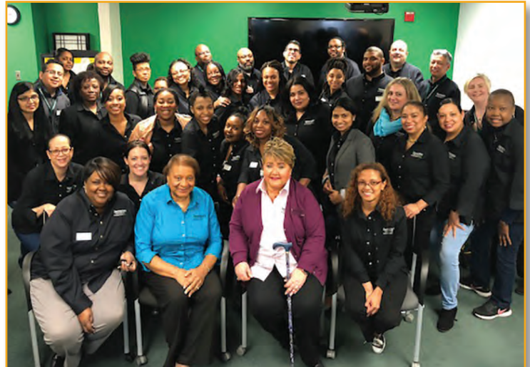
Democracy FCU staff.

Any staff, volunteer or credit union member was eligible to participate in the sweepstakes by making a suggested contribution of $10 to $20, which earned them chances to win a curved TV, wine refrigerator, video game system, a drone and other prizes!